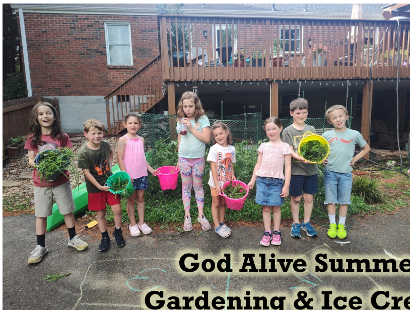
God Alive Summer Gardening & Ice Cream

Pre-register online at: tinyurl.com/RCPCSeniorSession721 or on the sheet in the Gathering Area.