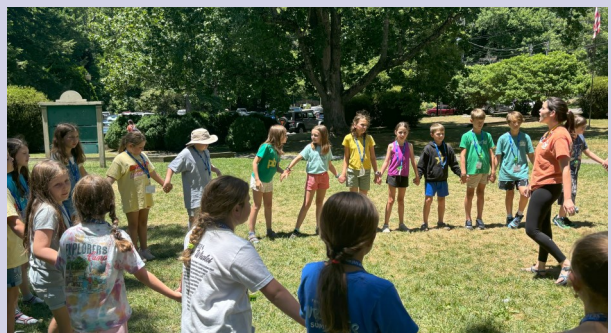
Montreat Worship & Music Conference