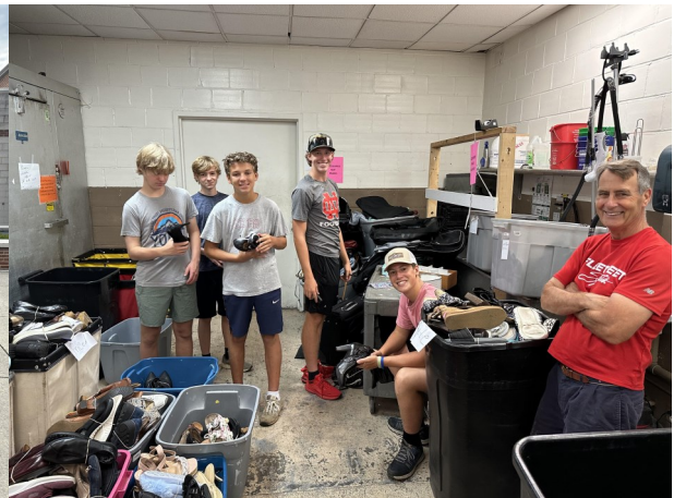
Roanoke Rescue Mission Thrift Store