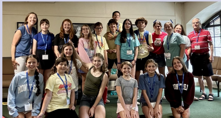
Montreat Worship & Music Conference