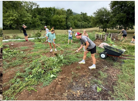
Morningside Community Garden