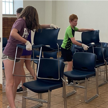
Roanoke Rescue Mission